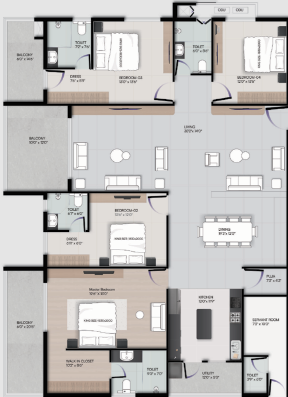
East Facing 4BHK Tower 2 3698sft