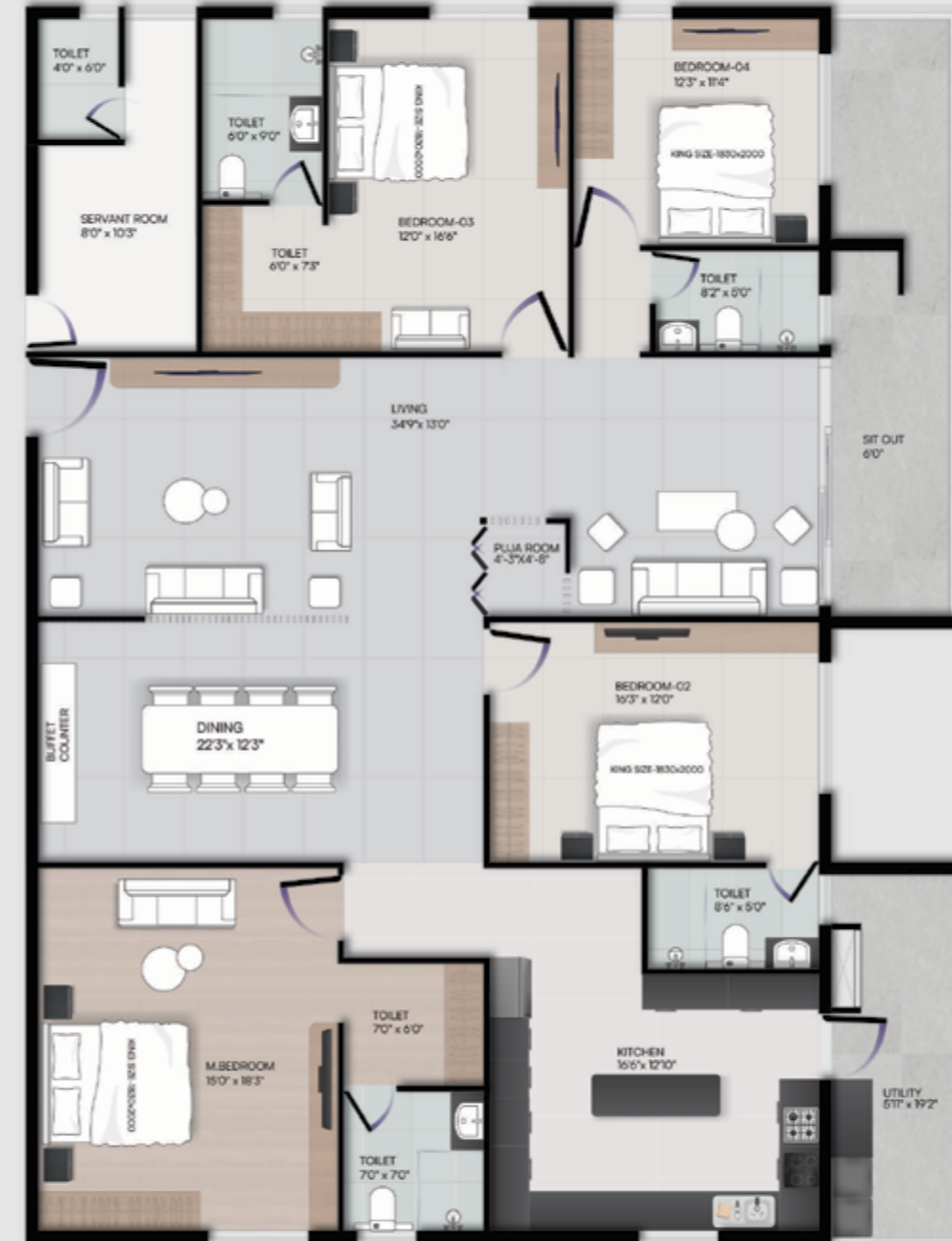
West Facing 4BHK Tower 2 3698sft