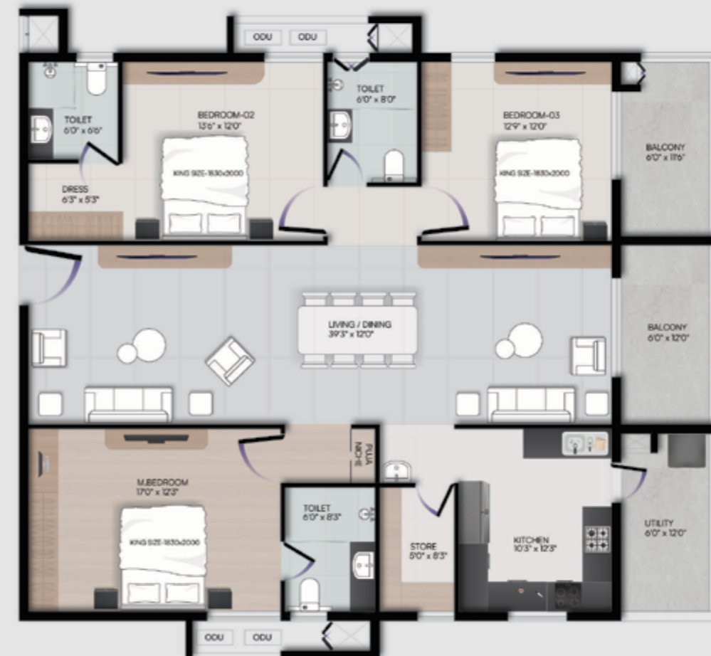
West Facing 3BHK Tower 2 2337sft