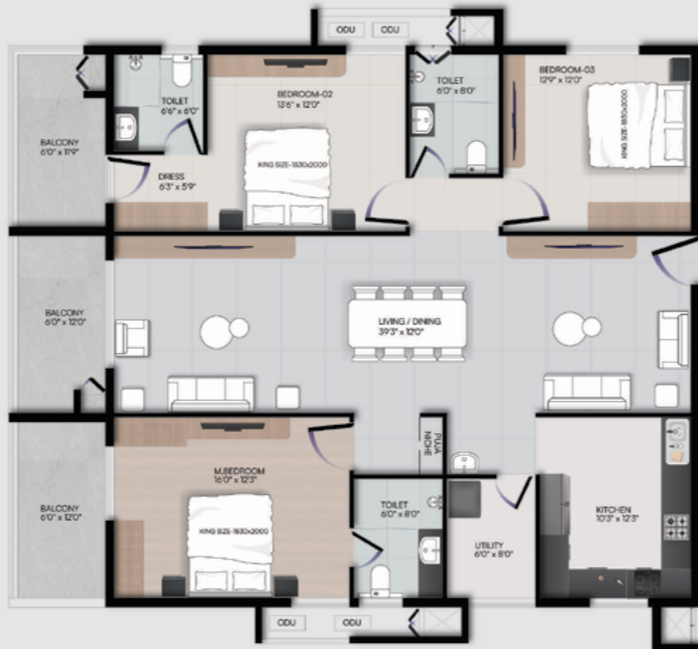
East Facing 3BHK Tower 2 2337sft